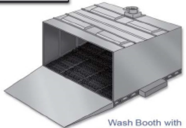
Wash Booth with Ramp and Exhaust