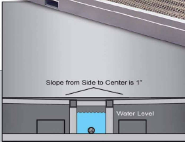
Front View Center Clean-out