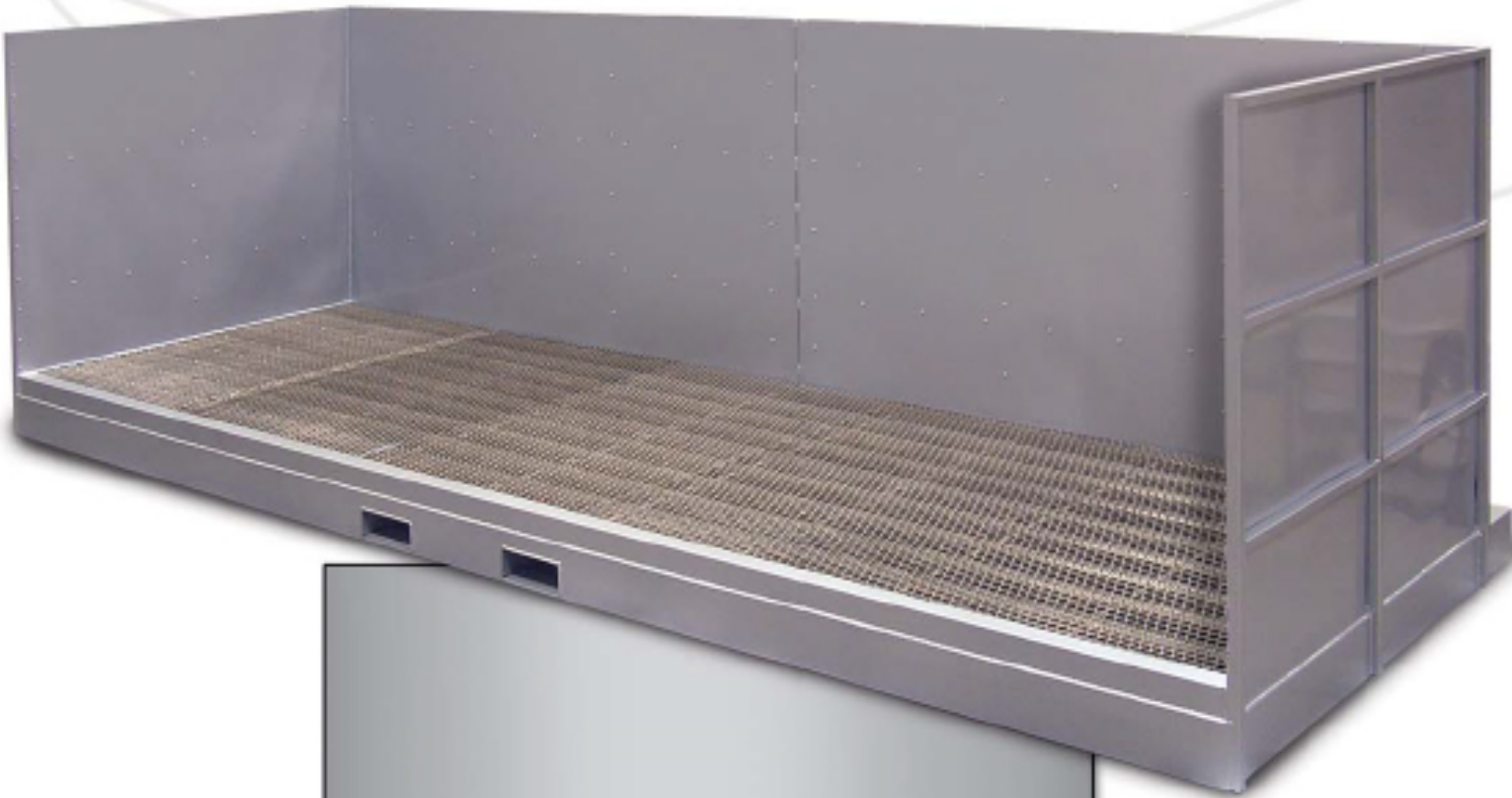
Large Wash Booth with Sidewalls